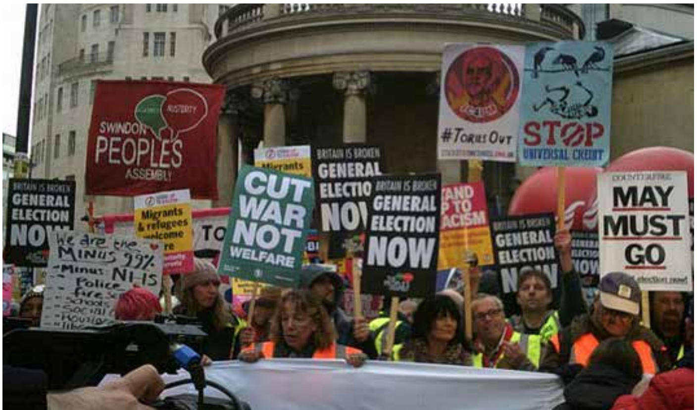
Demonstrators at the March against Austerity, London 13 January 2019

British Businesses are fearful that a no deal Brexit on the